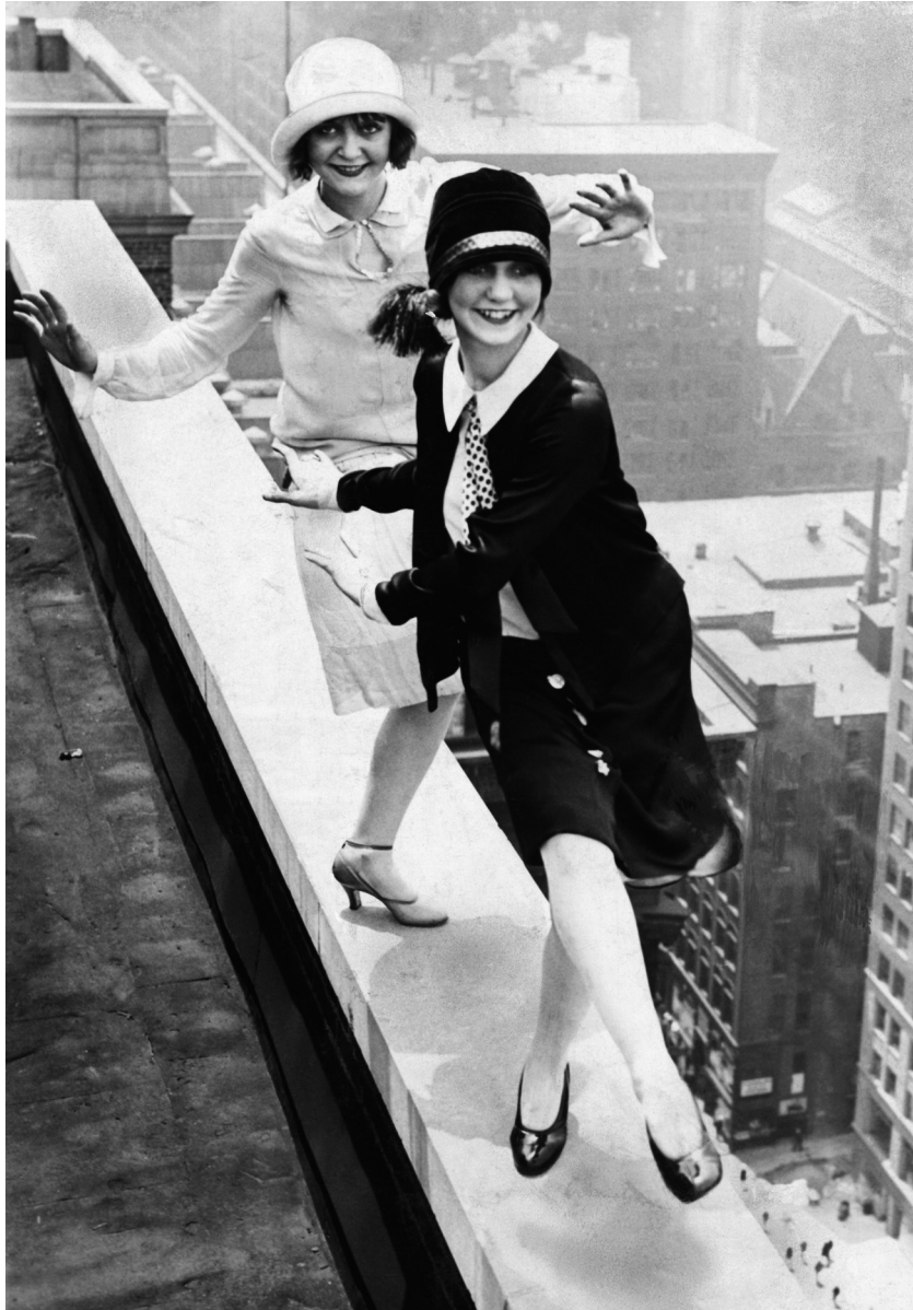
A photograph of two 'flappers' dancing on the roof of the Sherman Hotel, Chicago, 1926.