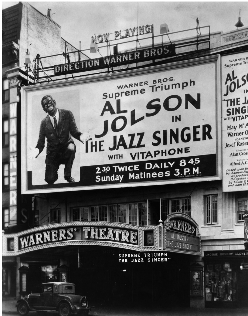
A huge billboard advertising the film, 'The Jazz Singer', outside a cinema in New York City, 1927.